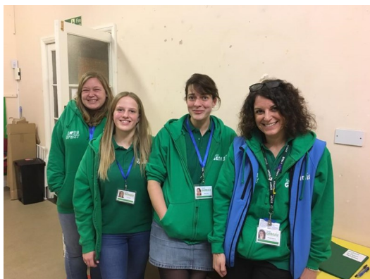
Left: Members of the Youth Work Team at St Andrew’s Methodist Church