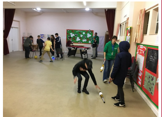
Right: Fun and Games at the Youth Drop-In at St Andrew’s.

Please send good news stories of worship, fellowship, mission and evangelism to Torbay Methodist Circuit Office by no later than 10th May to be considered for inclusion in the next issue of Connected .